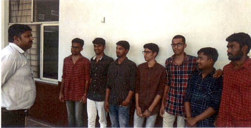
Convener Hostel Committee Cell CMRCET