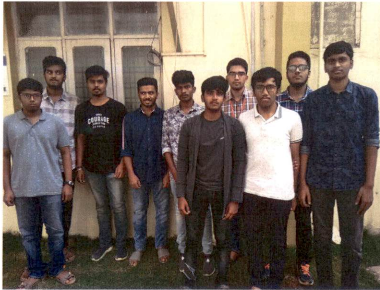
Convener Hostel Committee Cell CMRCET